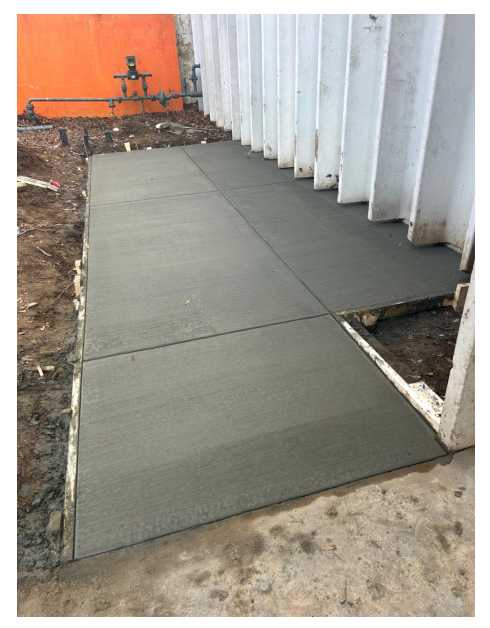
Concrete pads installed for mechanical units outside.