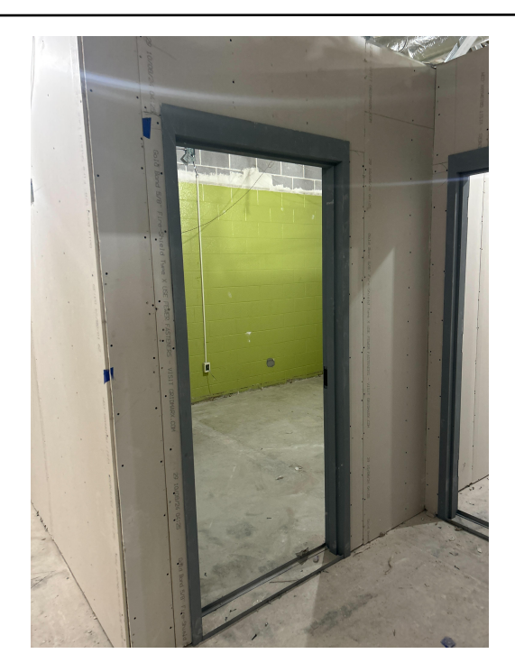
Setting door frames in classrooms on level 2.