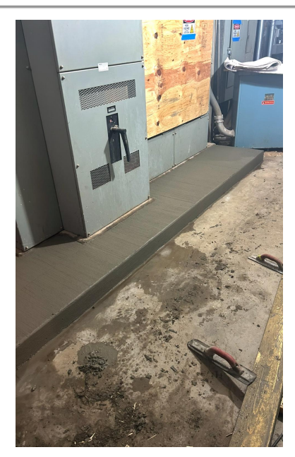
Concrete pads installed for electrical units on level 2.